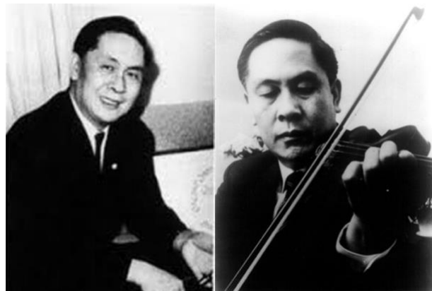
Pic 1 Ma Sicong portait